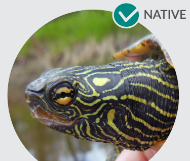
NORTHERN MAP TURTLE

Yellow stripes on head and yellow spot behind eye